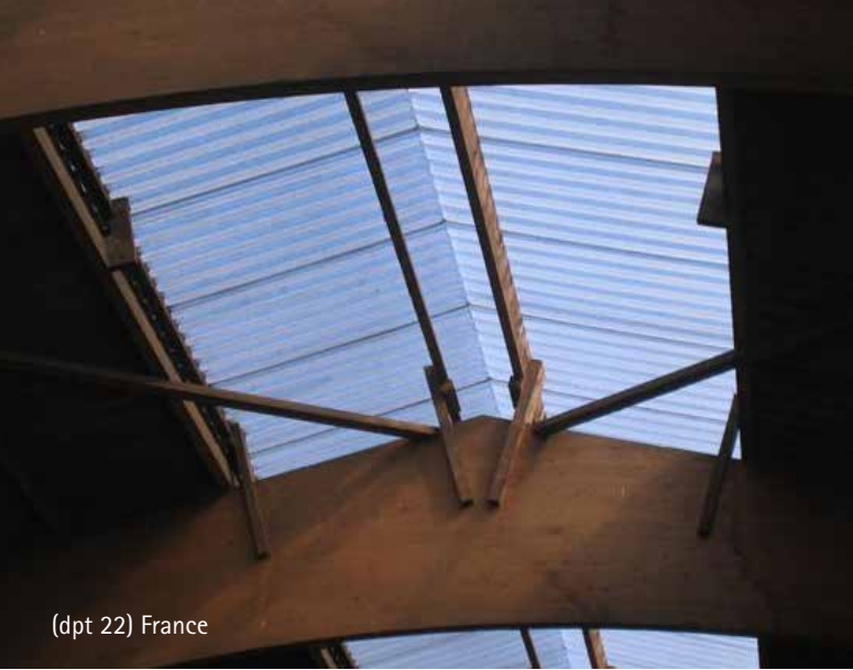
(dpt 22) France