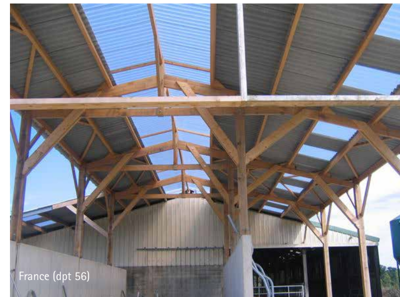
France (dpt 56)

RENOLIT Ondex - Avenue de Tavaux 21800 Chevigny-Saint-Sauveur - FRANCE Tel +33 (0)3 8046 8000 - Fax +33 (0)3 8046 8002 commercial.ondex@renolit.com - www.renolit.com www.ondex.com