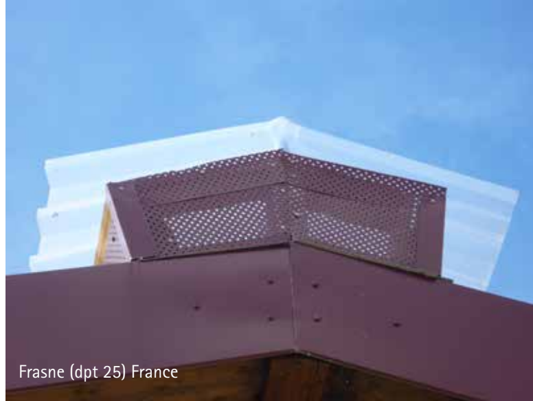
Frasne (dpt 25) France