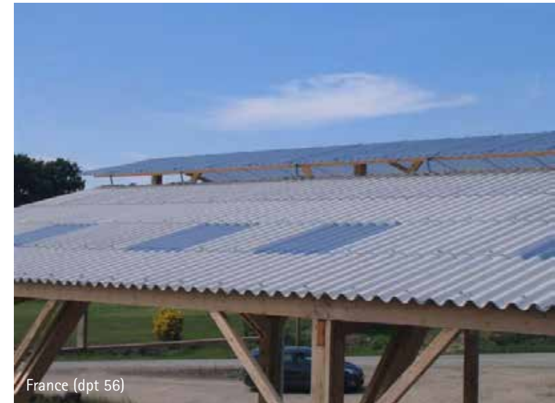
France (dpt 56)