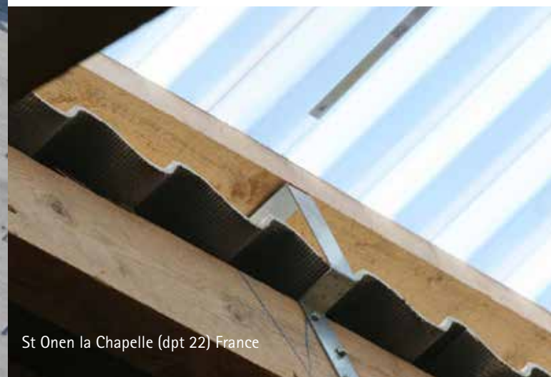
St Onen la Chapelle (dpt 22) France