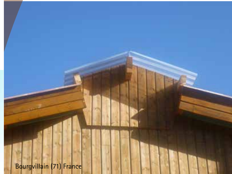
Bourgvillain (71) France