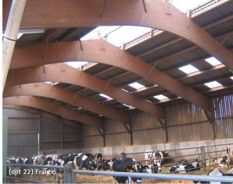
(dpt 22) France