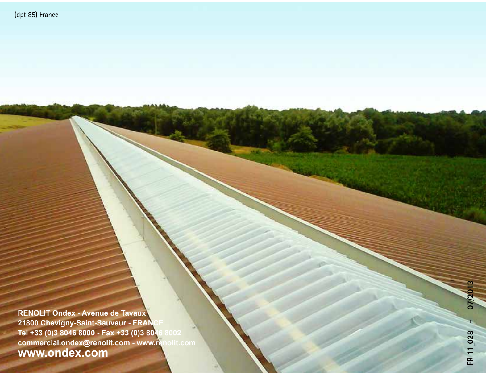
(dpt 85) France