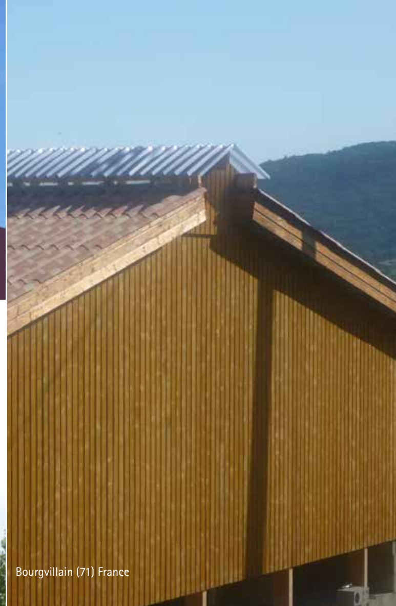
Bourgwillain (71) France